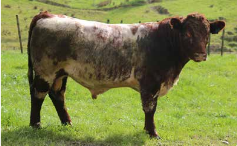
Lot: 5 Raupuha Wagman 16635