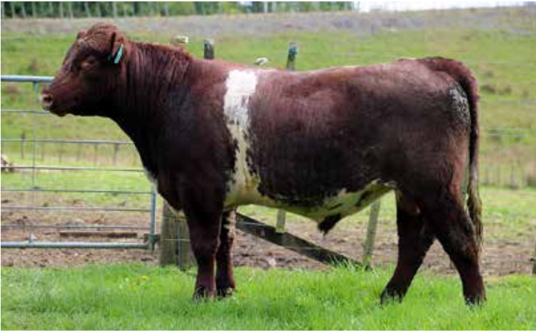
Lot: 1 Raupuha Ace 16663