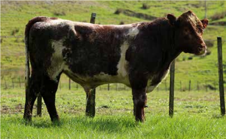
Lot: 3 Raupuha Rockyer 16651