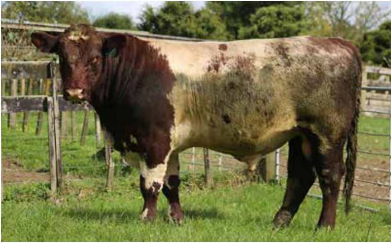
Lot: 4 Raupuha Lockyer 16654