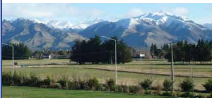
View from Motor Lodge, Hamner