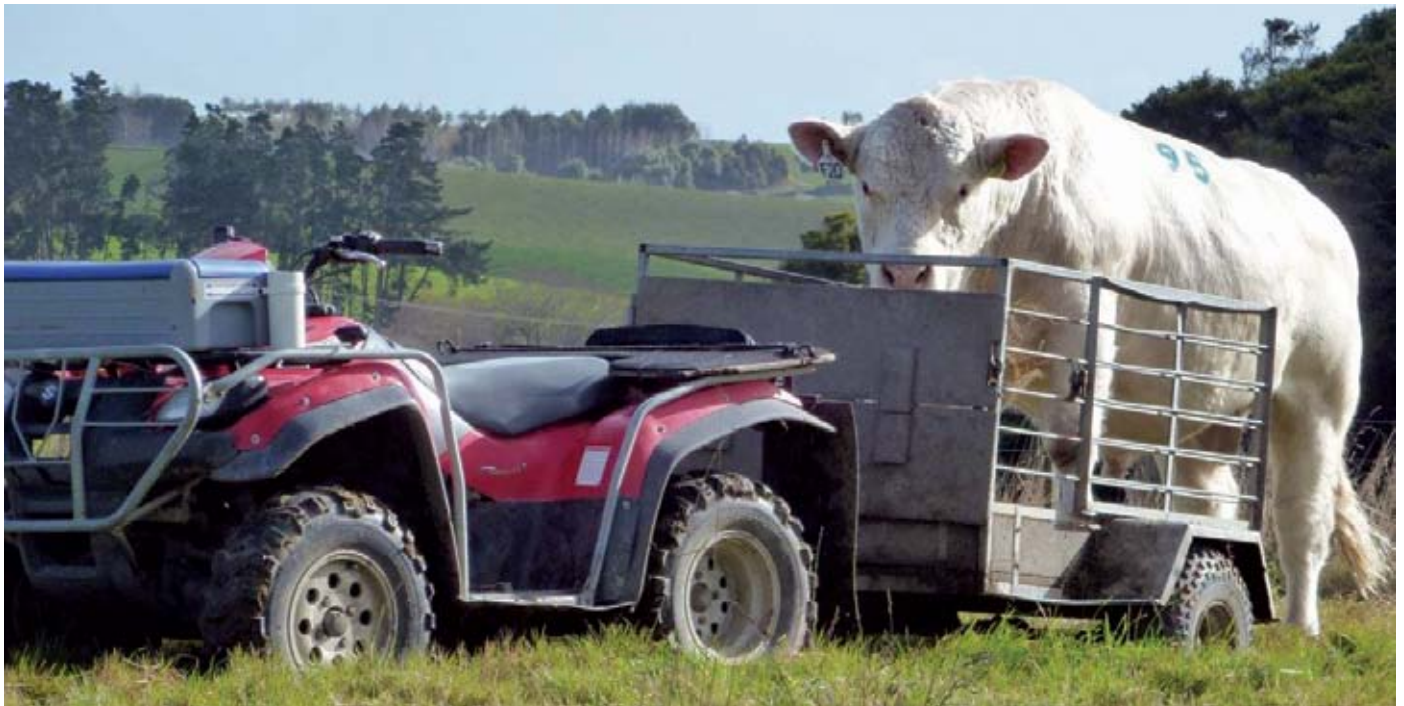
Kaitoke Future F20 (P) Reserve Allbreeds 2012

Extreme, Edition, Exclusive, Future, and Fletcher No 2.