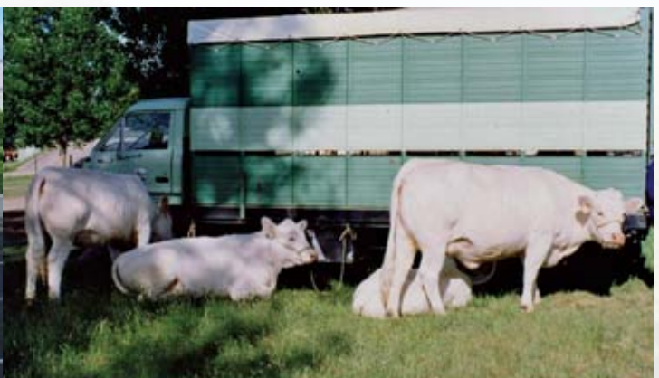
The Show team - Time out at the CHB show