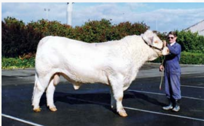
Kaitoke Jacko J1(P) at National Sales in Palmerston North 1996