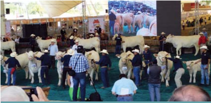
Judging of Female Championship