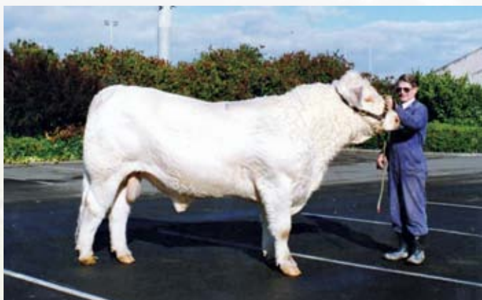
Kaitoke Jacko J1(P) at National Sales in Palmerston North 1996