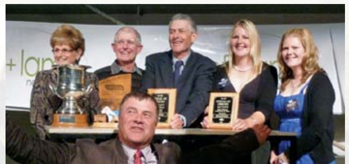
Celebrating Charolais success at Beef Expo 2011