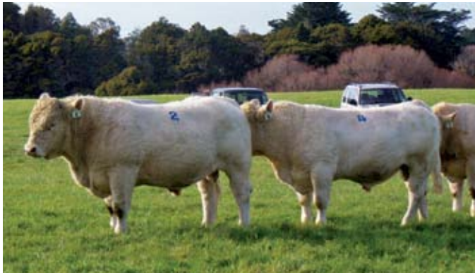
Two of Kaitoke's first bulls to enter bulltrial

In 2006 Charolais made a come back to the National Sale arena which was now being held at Manfield Park in Feilding under a name change of "Beef Expo".