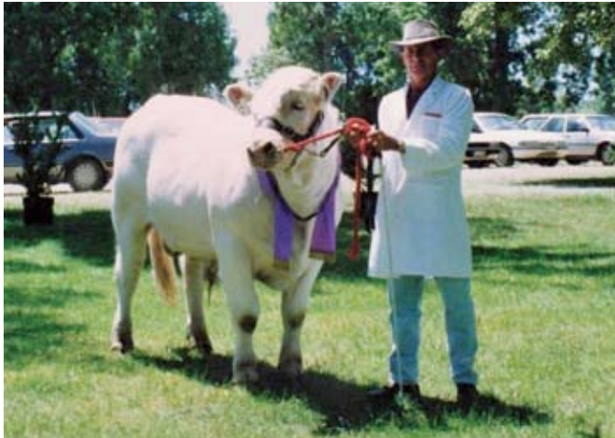
Kaitoke General at the CHB Show 1992

shows. Teaching some strong calves to lead was no mean feat but the use of the tractor soon tested their strength.