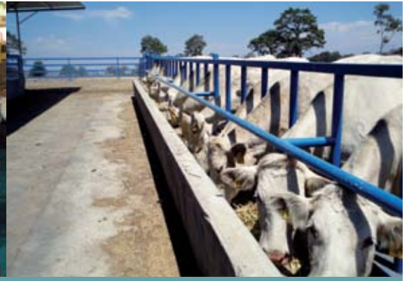
Cattle at La Providencia Ranch

ladies riding side saddle in Mexican costumes. The day concluded with a Mexican Fiesta where we ate more, drank plenty and even had a wee dance.