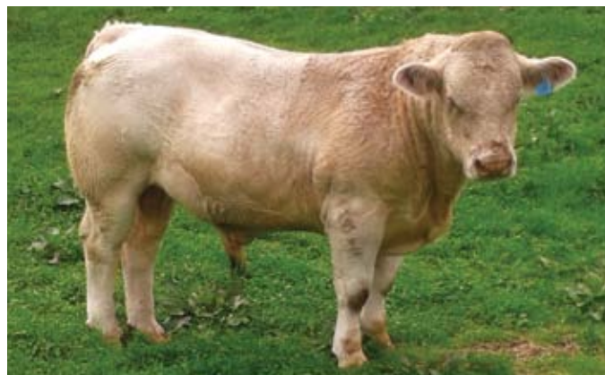
Champion Bull at the 2016 Beef Expo Nouvelle Jasper J9