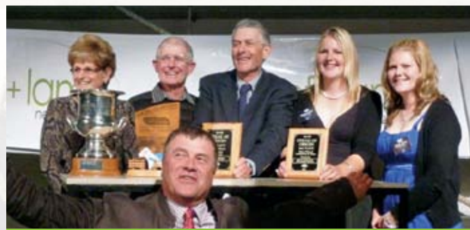
Celebrating Charolais success at Beef Expo 2011