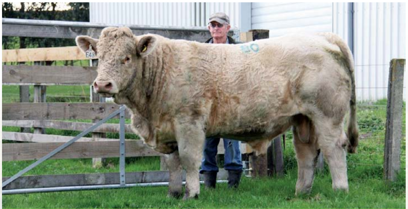
Kaitoke Extreme E48 Champion of Allbreeds 2011