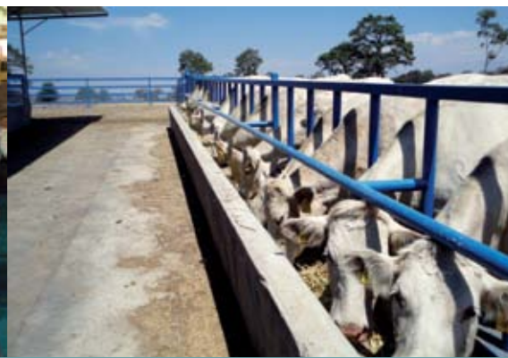
Cattle at La Procidencia Ranch

also incredibly interesting. We had a tour through the workshop where we saw various robots used to put the cars together then the partially completed car travels on a trolley to the next station. The most impressive part was that they make a new car every 37 seconds!