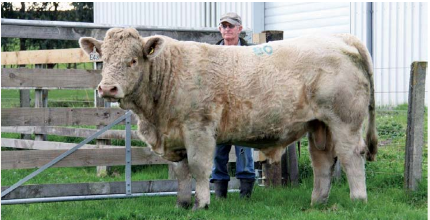
Kaitoke Extreme E48 Champion of Allbreeds 2011