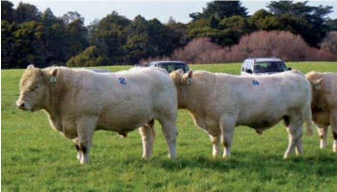
Two of Kaitoke's first bulls to enter bulltrial

In 2006 Charolais made a come back to the National Sale arena which was now being held at Manfield Park in Feilding under a name change of "Beef Expo".