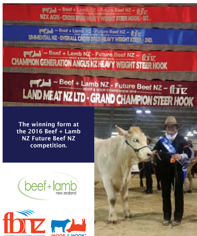
The winning form at the 2016 Beef + Lamb NZ Future Beef NZ competition.