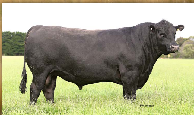
Tussock's Sire - Ayrvale Bartel E7