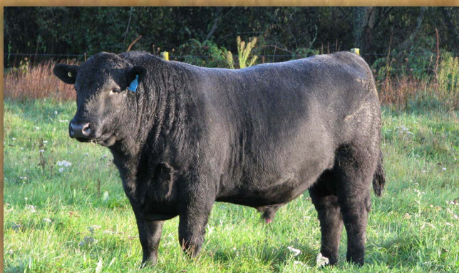
MF Outlaw 1992