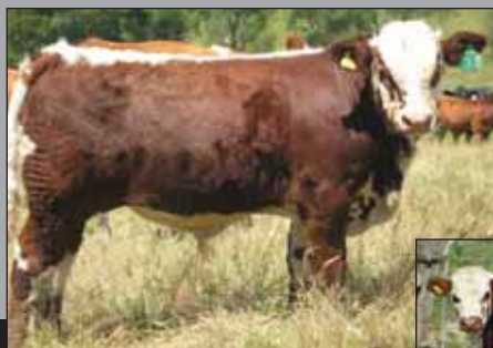
Top: Maungaraki Rosso, Pustertal-Simmental Hybrid ~ "Supertal" Right: Maungaraki Rosanna, Pustertal-Simmental Hybrid ~ "Supertal"