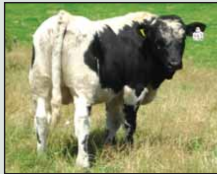
Maungaraki El Toro, first Purebred Pustertal in New Zealand. ADWG from birth to 200 days: 1.75kg