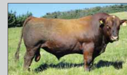
Gladstone T107, Balancer Sire 67% Gelbvieh/33% Red Angus

These bulls carry a mix of Gelbvieh and Red or Black Angus genetics. They are extremely hardy and particularly popular in the US amongst cattlemen who want to breed more moderate framed cows on some of the harsher areas of the states.