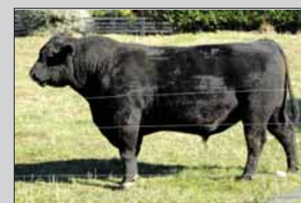
Gladstone W17 Junior Herd Sire, 100% Gelbvieh

Our senior herd sire Waitapu Reflection 876 cemented our breeding programme leaving us with a strong line of replacement heifers and magnificent easy doing and docile sale bulls. Reflection will soon be going into quarantine for semen collection for Australia.