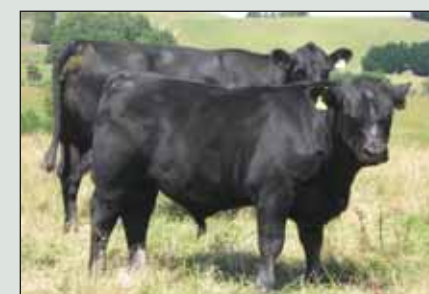
Typical Waitapu Reflection progeny.

MCC established Gladstone Angus stud in 1996. The herd currently consists of around 60 breeding females with the aim of building up to 100 select cows within the next few years. Since its establishment we have applied rigorous selection criteria being particularly strict on structural soundness and doing ability. We are proud of our female herd and feel confident that they would match up with any stud herd in the country.