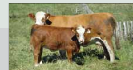
Wai-iti Unique L64 and calf.

The feature female of the day was Wai-iti Unique L64, dam of Wai-iti Nutcracker (who sold for a record price of $39,000 at the 2005 National Beef Expo). She sold to Brian Aldridge from The Mews at Lincoln near Christchurch for $6100.