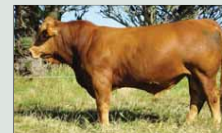
Gladstone W17 Junior Herd Sire, 100% Gelbvieh

Established in 1989 the Gelbvieh herd has stabilised at around 60 breeding females. Clients who purchase Gelbvieh bulls appreciate their true worth in particular their maternal value. Gelbvieh sired replacement females are in great demand throughout the country. The docile trouble-free females require minimal attention and rarely wean a calf under 300 kgs.