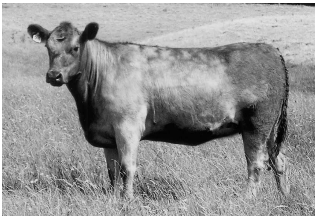
Winner: Ballee Tui 28th 969-08, Sired by: Lerwick Park Zeppelin Dam: Ballee Tui 22nd 659

The competition for June /July was for rising 2 year old heifers. Eleven entries were received and photos of these will be available on the Murray Grey website under photo gallery.